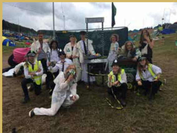
Boomtown Festival - 2019 With 'Sense In Dimensions' Eco Police. engaging with festival goers about their waste.